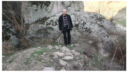
Fig. 2. South part of CocevKamen, in front of the altar