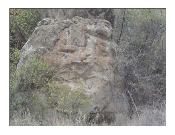
Fig. 9. A 2m high sculpture of a king dating 3,000 B.C., Kumanovo region, purposely damaged by careless people