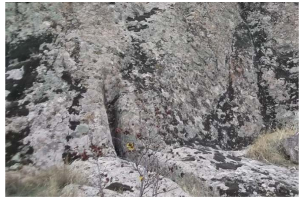
Fig. 5. engraved eye of the Great constructor at the entrance of the CocevKamen dating 3,000 years B.C.