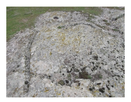
Fig. 3. An engraved shamanic altar with a spiritual hole at CocevKamen, around 3000 years B.C.