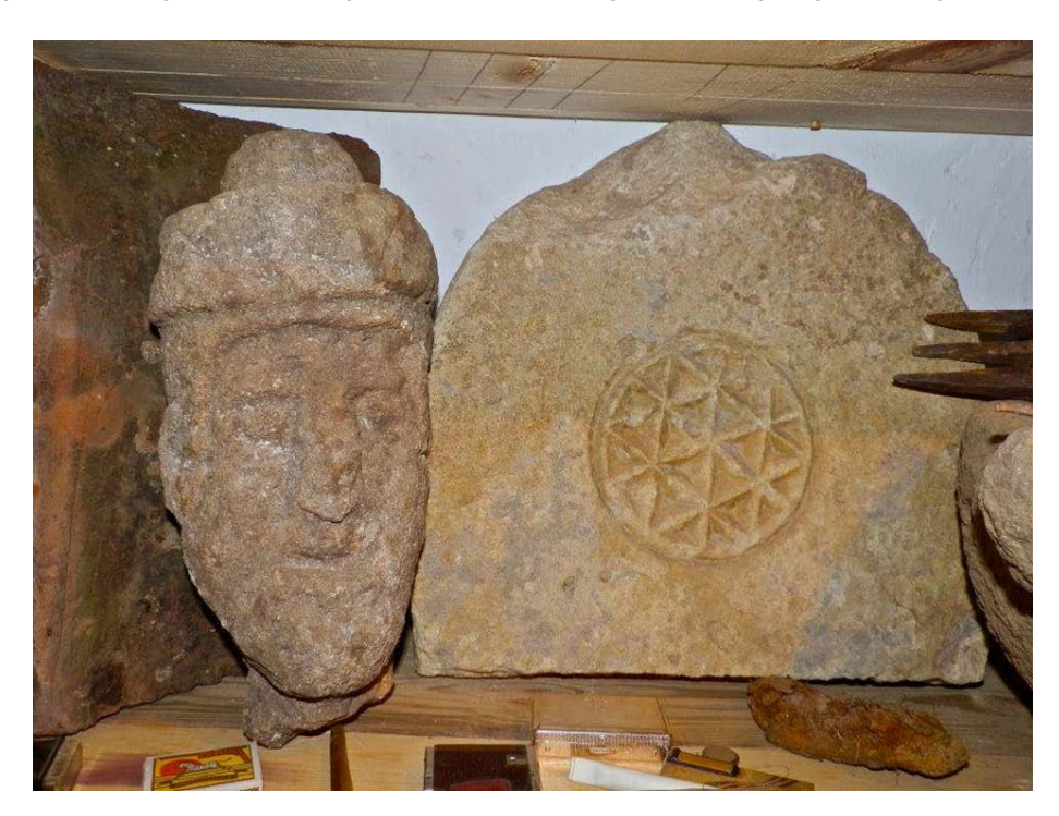
Fig. 13. A 3 x 3 symbol found in Macedonia, reflecting the three cosmic grids: Curry's, Hartmann's and Stojan's grid