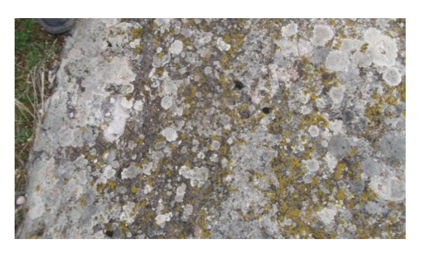
Fig. 4. Three spiritual holes dug for healing purposes at Cocev Kamen, around 3000 years B.C.