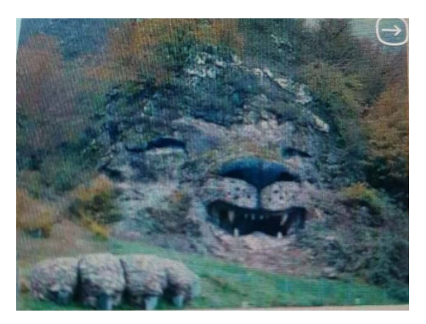
Fig. 11. Sleeping Lion, Prilep region