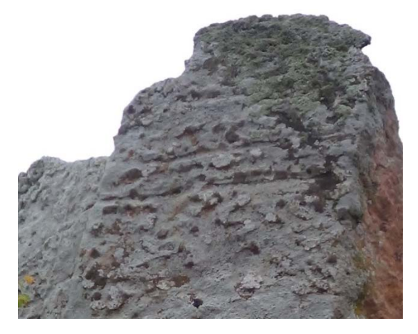
Fig. 8. Stone- inscription still unknown for the public and undecoded, dating around 3000 years B.C., Kumanovo region