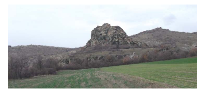
Fig. 1. CocevKamen

Stone art andhealing Official, modern-day medicine is a new method and approach to healing, in its attempt to unite conventional and traditional (alternative) methods. Traditional medicine was performed by specially trained individuals known as shamans. They knew how to relate the spiritual with the nature and the human beings. They chose appropriate rock masses, processed them by certain markings and engravings on the stone itself and performed special spiritual rites. Those rituals most frequently included sacrifice which would be "documented" by visible engravings carrying appropriate memory into the stone. They were thus creating a spiritual – occult altar where they would lay the patients and heal them by a special ritual. Such spiritual activities were performed on several parts of the Macedonian area. One of those locations was the Neolithic observatory of CocevKamen, Kratovo region (Fig. 1) The first estimations indicate that this observatory dates from before 3000 years B.C.