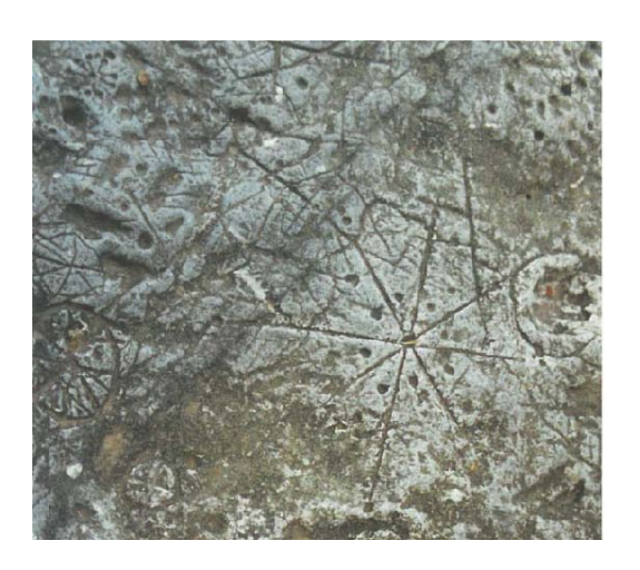
Fig. 7. Engravings dating earlier than 3,000 years B.C. in the Belasica mountain

Stars are one of the stone- engraved elements, as well as the eight- or 16-pointed sun as a characteristic of the ancient Macedonian peoples, (Fig. 7). Besides the engravings, that were used for special purposes, there are also stone-engraved scripts. One of those is the relief script found in Kumanovo which has not been deciphered and is still a challenge to the scientific world.