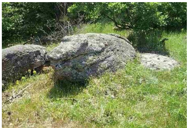
Fig. 12. The Big Alligator, Osogovo Mountains